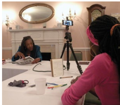
Top to bottom: Youth interview a Choctaw Nation historian for an exhibition in Poteau, OK, a student team from Lansdowne High School gathers stories from a business owner in Ellicott City, MD, and a youth story collector interviews a community member in St. Joseph, MI

Coming Home: Stories from Main Street is a project that invites young people to learn about their communities, document local history, and foster important discussions about their community's future by: