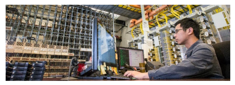
Rural communities across the country are innovating. They're using tools like broadband service to transform agriculture, business, education, health care, and other areas of daily life. Pine Net Telephone/Internet, Oklahoma

Get YOUR STORY in a new Smithsonian EXHIBITION about innovation in RURAL AMERICA!