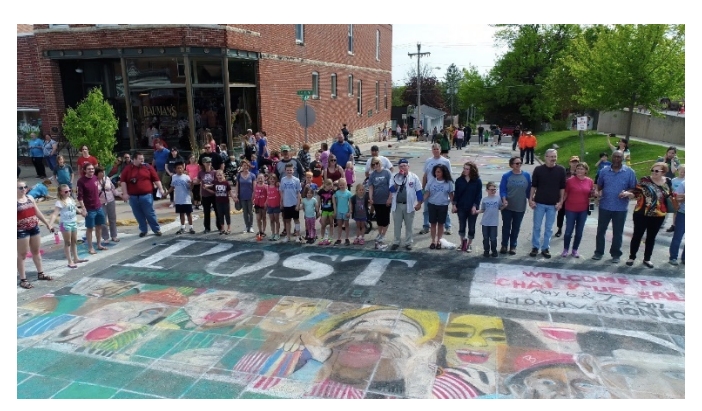
Chalk the Walk features collaborative artwork in Mt Vernon, Iowa. Mt Vernon hosts numerous events and a business incubator to foster community and entrepreneurship.

Spark! Places of Innovation is a new traveling exhibition from the Smithsonian Institution that will dive into innovation and invention happening in rural America. The exhibition will travel from 2023 to 2029, sharing these stories with thousands of visitors in rural communities throughout America! Could your story be among them?